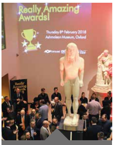
Oxford Bus Company employees at the Ashmolean Museum, for the inaugural "Really Amazing" awards, February 2018.

All employees are encouraged to nominate colleagues who they feel deserve to be a "Star of the Month". Stars win £100 of Love2Shop vouchers, a certificate and also have their framed photo displayed in the depot. Every "Star of the Month" is invited to attend the annual "Really Amazing" awards, with a three-course meal and the chance to win further prizes.